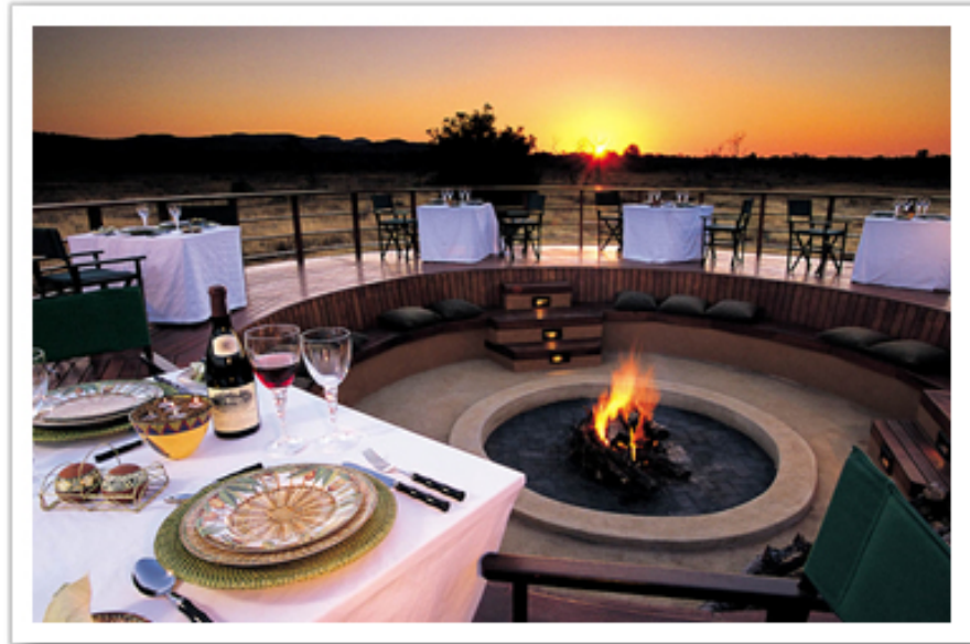
Outdoor dining at Mateya Safari Lodge

For a once in a lifetime experience that features both fine amenities and great safari viewing, look no further than Mateya Safari Lodge