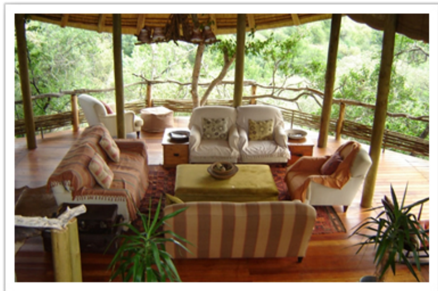
Buffalo Ridge Safari Lodge Central Lounge Area

Buffalo Ridge Safari Lodge provides luxury accommodations at good value