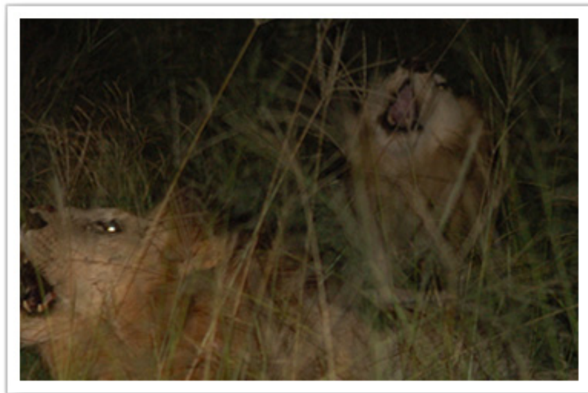
A truly special Madikwe Experience I'll Never Forget

It was late in the day and we returned to check on four male lions (2 mature and 2 immature) that we had seen sleeping earlier. We drove off road and parked just ten feet away from the closest, a large regal lion. As darkness fell the lions began to roar.