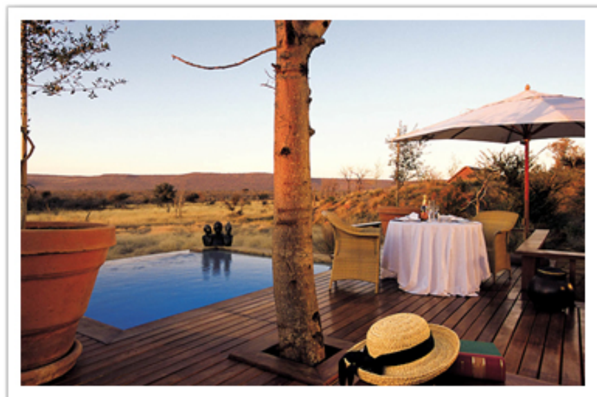
Chalet private deck and plunge pool

Cool off after a hot drive in your very own private plunge pool